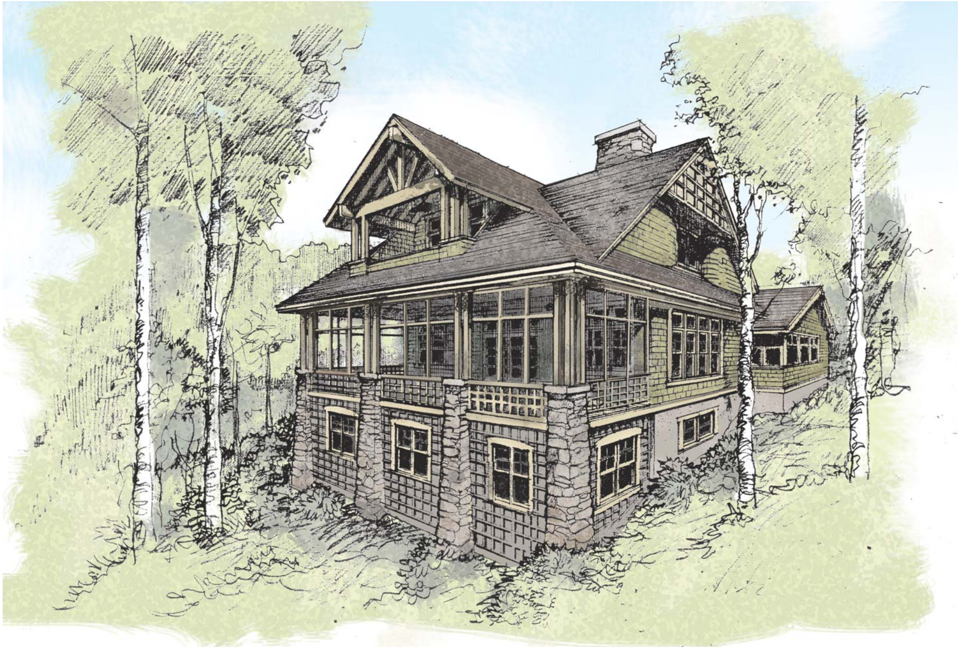
LAKE SIDE COTTAGE