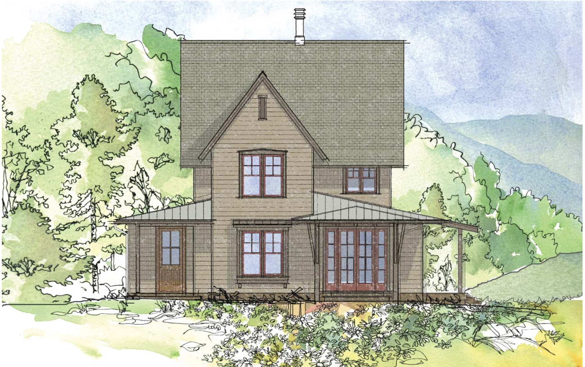
HIGH MEADOW COTTAGE